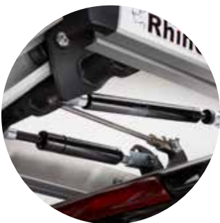
Gas-assisted lifting - safe, ergonomic ladder handling