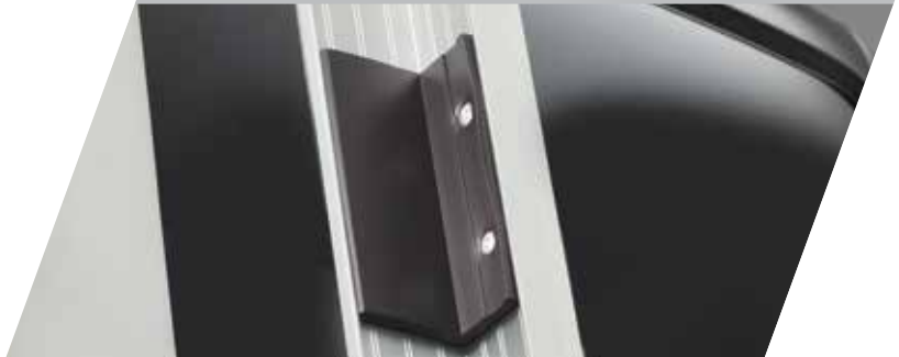
Rubber bump stops to protect your ladder